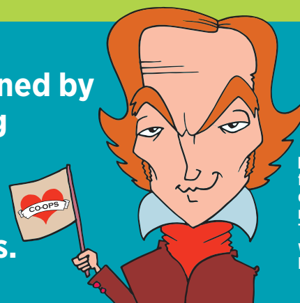
Robert Owen , father of the co-operative movement. The first co-op was created in England in 1844.

Twice as many co-ops remain in business after 10 years as other business enterprises.