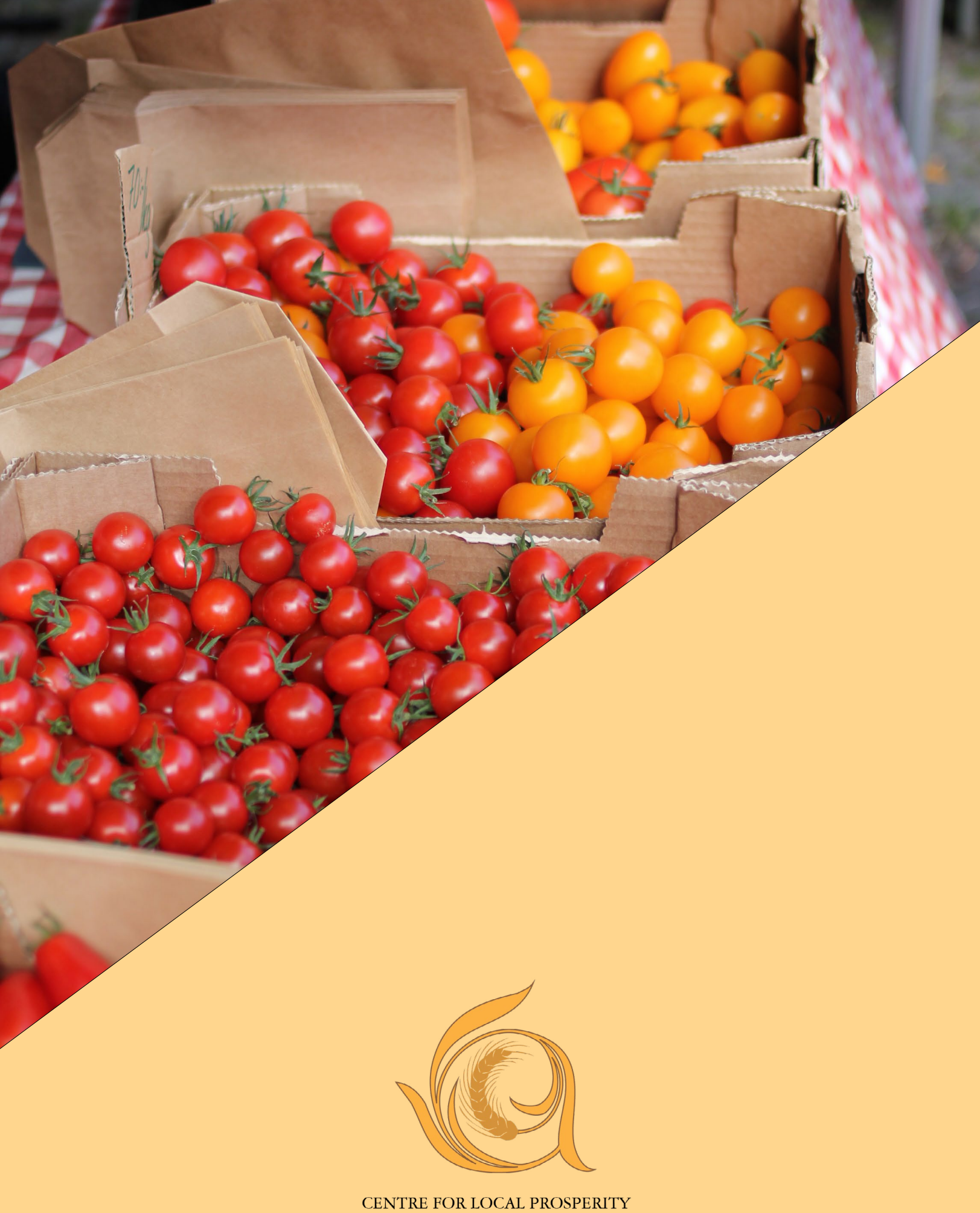
CENTRE FOR LOCAL PROSPERITY centreforlocalprosperity.ca