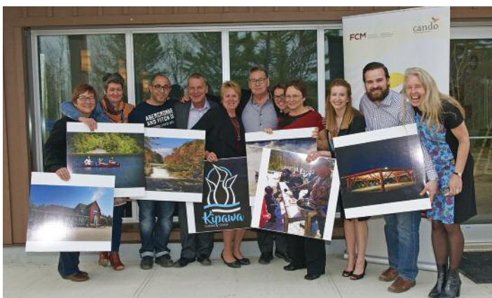
Mayors, Chief and Economic Development Officers celebrate the launch of their joint tourism products.

The last activity of the partnership under CEDI support took place in June 2015, but the tripartite collaboration continues to flourish and grow.