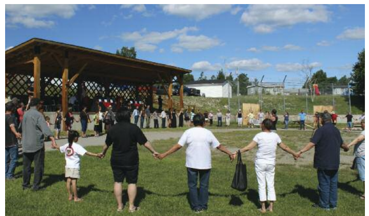
Round dance at Friendship Accord Signing in 2014.

Reflecting on the lessons learned from the CEDI project, Roy spoke of open communication and