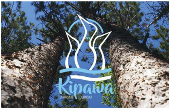
New joint tourism logo.

The launch event culminated with a preview of the promotional video developed as part of the tourism strategy. With the fitting theme “At the heart of nature,” the three communities are poised to take flight into their future.