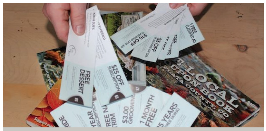
Local First's Be Local Coupon Book, La Plata County, Colorado.

Create a "local flavor" or music video to highlight what's special about your community and to foster pride in your place. See ▶ Denver Local Flavor Guides and videos, ▶ The Grand Rapids (MI) LipDub, ▶ My City (Fort Wayne, IN), and ▶ Detroit "On a Good Day." (See also our short video, below, and "Step-by-Step," pages 4–5.)