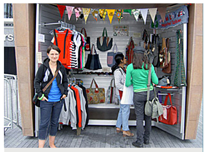
Girl With Beads KiosKiosk popup store in Nottingham, UK.

Use both traditional and new media to raise awareness about your pop-up initiative. Send out a press release describing the project and your motivations behind it, including the many potential benefits to the community and local economy. Use social media to attract supporters and to notify people about participating retailers, upcoming sales, and special events-be sure to underscore the limited-time nature of the initiative. Focus your publicity efforts on the local area—get residents excited!