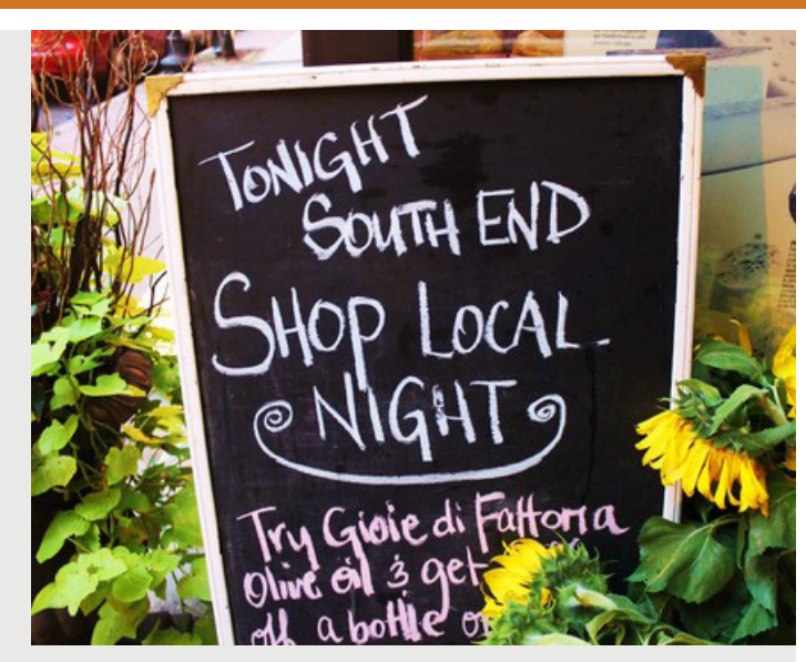
'Shop Local' Wednesday in Boston's South End.