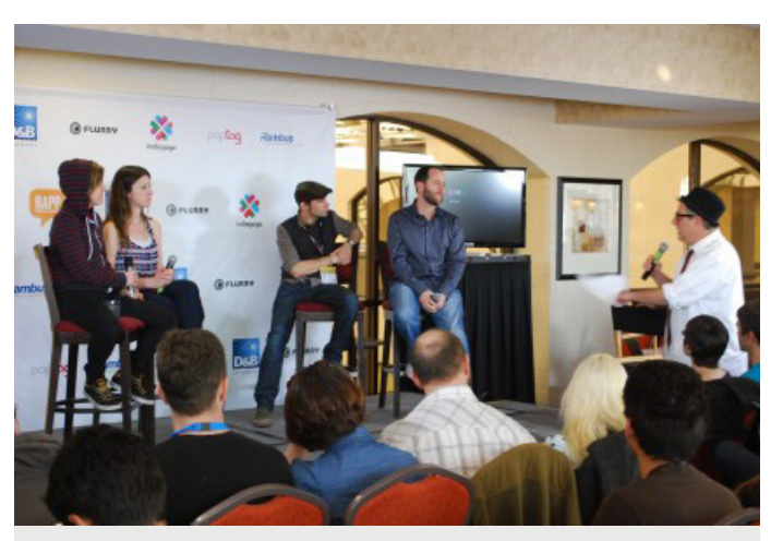
Pitchfest at SXSW Interactive Festival in Austin, Texas.

Since relationships are the goal, create an environment on event day that encourages conversation. Have table space available for each presenter (samples, flyers, collateral, signup sheets, etc.) and make sure there's plenty of room for conversations and interaction. Distribute a program or flyer that includes the list of entrepreneurs and their contact information for attendees to take home.