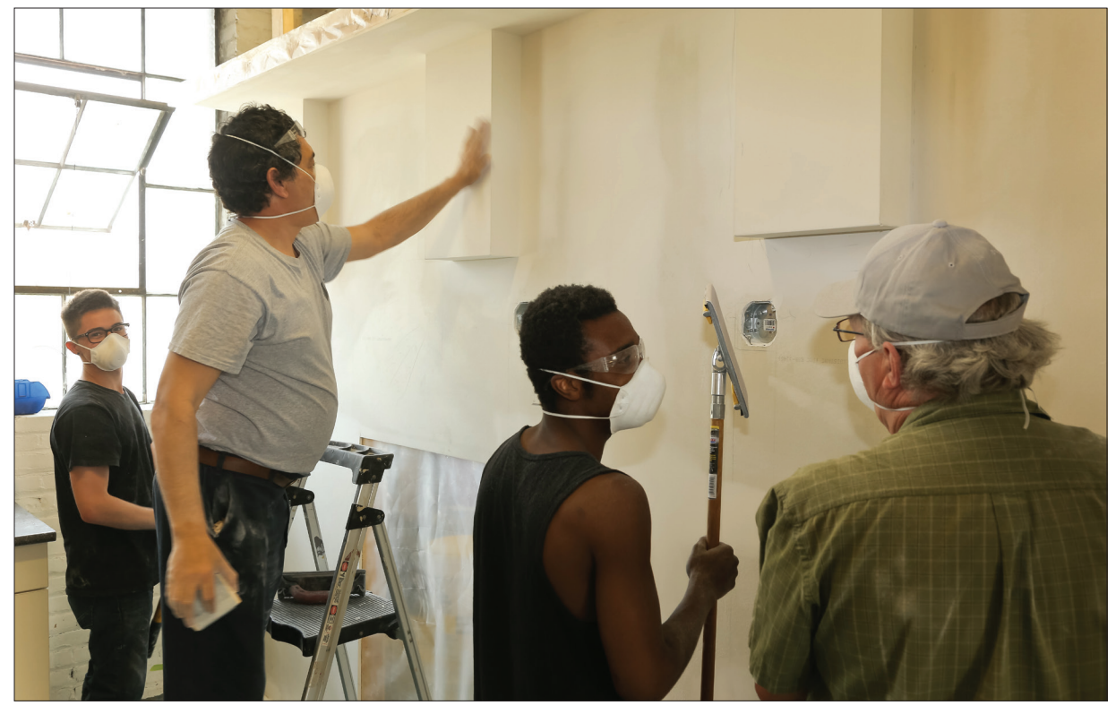
BUILD trainees and instructors

enterprise sector, as NECRC, MGR, and ICR all take on BUILD graduates. Under its new model, BUILD acts as a feeder enterprise, training workers who come from Employment and In-