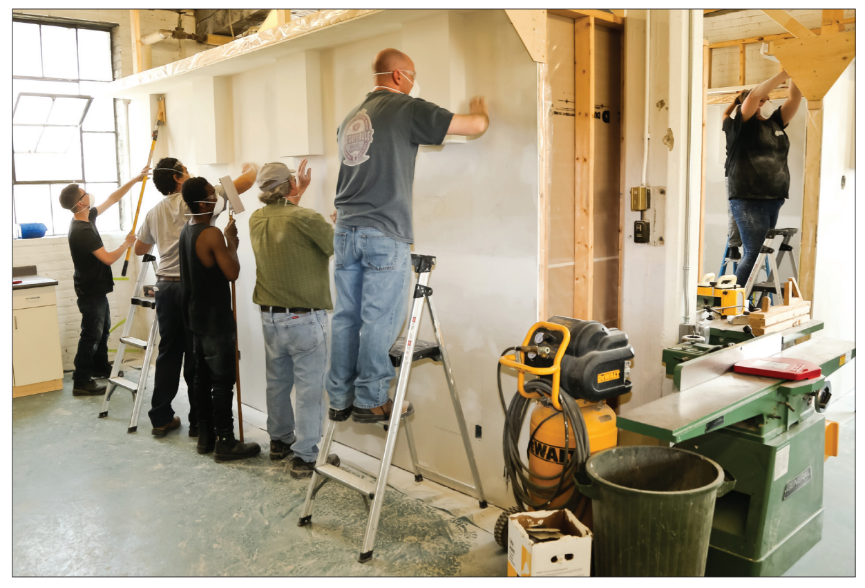
BUILD trainees learning painting techniques

after BUILD. Help you make goals, and know your strength and work on your weaknesses so that your life skills are good, that's really how to know what to do after.