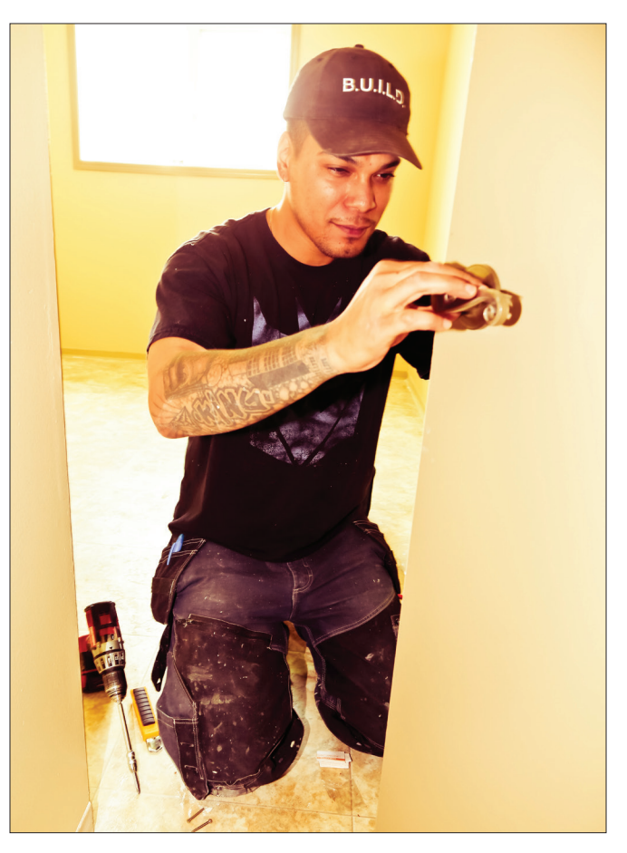
BUILD trainee at work

The effect on the participants in their future labour-market participation is less clear. To date there has been little research on the impact of