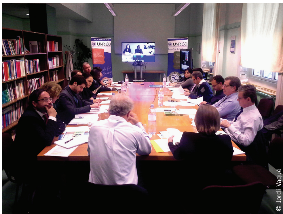
Fourth meeting of the Task Force on Social and Solidarity Economy, 3 April 2014, Geneva.

Local governments, and processes such as decentralization, can play a key role in providing the enabling environment needed for local economic development, variously through health, education and other areas of social policy; technical support services; building-up of infrastructure; public procurement; and facilitation of farmers' markets. 47 In several Latin American and European countries such enabling roles are particularly apparent. But as in the national policy-making arena, it is essential that SSE actors are organized and capable of participating effectively in policy dialogue and decision-making processes. Democratic decision-making and adherence to social and ecological criteria provides SSE leaders with a degree of legitimacy for participating in local governance and the co-construction of public policies.